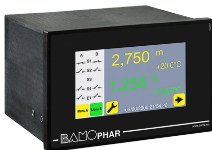
Panel mounting unit