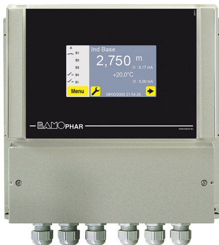
Wall mounting unit