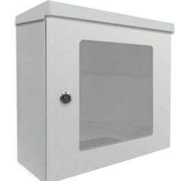
With window and canopy